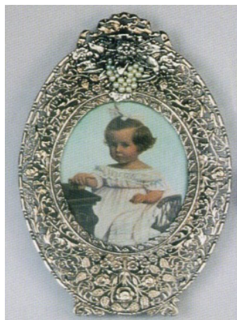
VC-21109 Filigree w/ Pearl Grapes, 3" x 2 1/4"