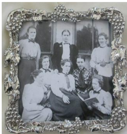
VC-13 Garland of Grapes 3 1/8" x 3 1/4"

Now connoisseurs can complement their fine wine with photo frames, napkin rings and accessories from Beautiful Things.