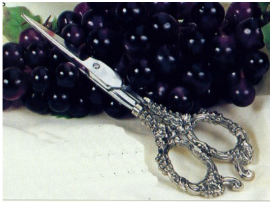
VC-238 7" Grape Shears, stainless steel blades