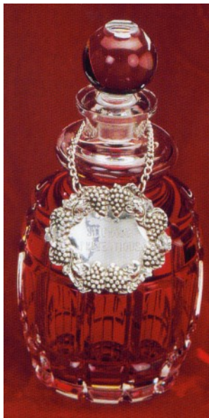
GS-251 Liquor Tag, "Slightly Pretentious"

"In water one sees one's own face; But in wine, one beholds the heart of another." Old French proverb