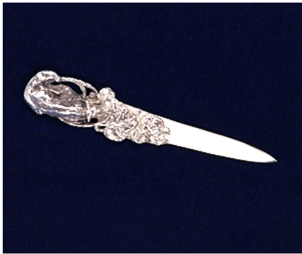
GS-302 Letter Knife—Fox w/ grapes