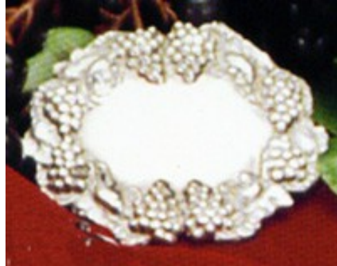
GS-252 Grapes Engraveable Bottle Tag w/ Chain