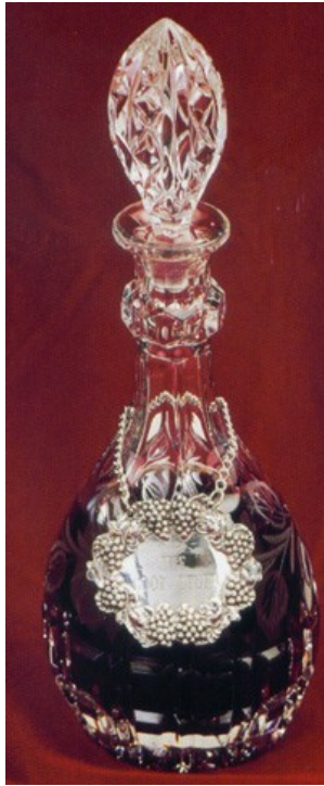
GS-250 Liquor Tag, "The Good Stuff"