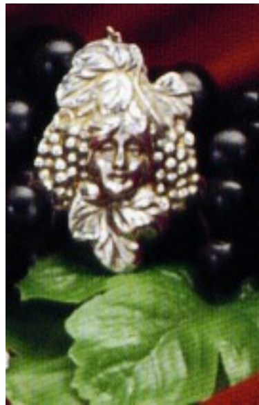
VC-225 Vineyard Goddess Bottle Tag w/ Chain