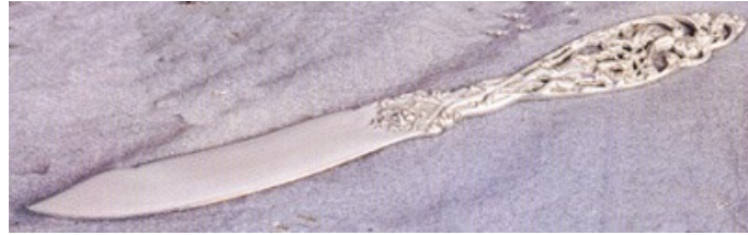
VC-323 Letter Knife—Cherubs w/ Grapes