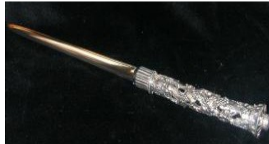
VC-336 Letter Knife—Openwork Grapes