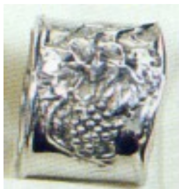
VC-290 Grapes Napkin Ring